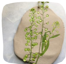
I am crazy about ferns!

We just slice off chunks and made different shapes with it. Then we rolled it flat. Next we place a bit of plant or flower onto the clay and rolled over it gently with a smooth water bottle. Pull the plant off the clay and admire the details now imprinted in the clay. If you want to add a hole-this is the time to grab your kebab skewer or chopstick.