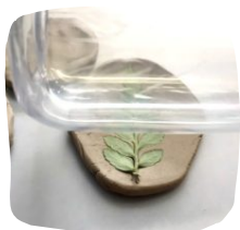
Pressing the imprint with a waterbottle as my rolling pin

So you will need CLAY and a very smooth surface to work on. You also need some flowers or plants, a rolling pin or water bottle that has smooth sides. Later when the clay is dry you may want to use some craft paint to add the green or flower color. Also if you want to turn it into a mobile or wind chimes you might need a chopstick or skewer to poke a hole in it.