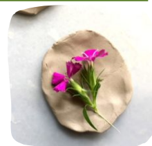
Using your hands flatten the clay and add flower

So you will need CLAY and a very smooth surface to work on. You also need some flowers or plants, a rolling pin or water bottle that has smooth sides. Later when the clay is dry you may want to use some craft paint to add the green or flower color. Also if you want to turn it into a mobile or wind chimes you might need a chopstick or skewer to poke a hole in it.