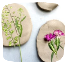
So pretty I didn't want to pull the plants out of the clay

We just slice off chunks and made different shapes with it. Then we rolled it flat. Next we place a bit of plant or flower onto the clay and rolled over it gently with a smooth water bottle. Pull the plant off the clay and admire the details now imprinted in the clay. If you want to add a hole-this is the time to grab your kebab skewer or chopstick.