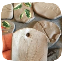
Use a chopstick to poke a hole in the soft clay