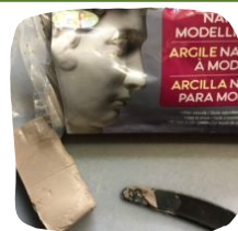
Natural Clay from the Dollar Store