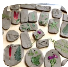
Pause to admire...then pull the plants out