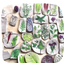
After its dry add colour to the clay

This project has a lot of possibilities so let your imagination go wild. Find things around the house with interesting textures to imprint the clay.