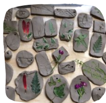
Wet Clay is dark and lightens as it dries

Allow the clay to dry overnight. It should feel completely dry before you paint it. I just used regular craft paint.