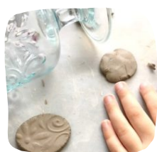
Try to imprint clay with other things around the house. The side of this glass looked interesting.

Allow the clay to dry overnight. It should feel completely dry before you paint it. I just used regular craft paint.