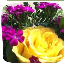
Lovely Flowers & Fern